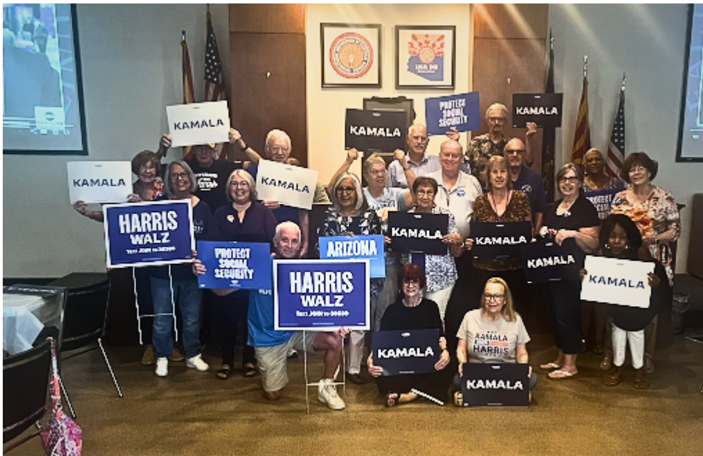
Arizona Alliance debate watch party