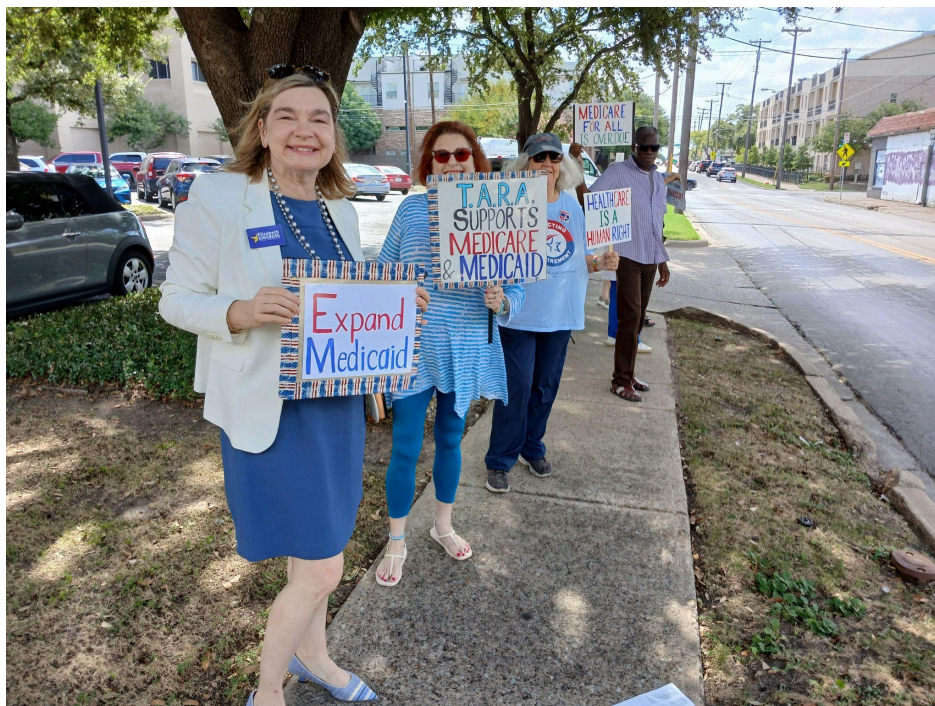
Texas Alliance members celebrated Medicare’s birthday in Dallas Tuesday