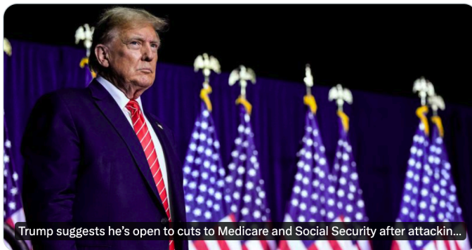
Trump suggests he's open to cuts to Medicare and Social Security after attackin...

Just a few months ago, Donald Trump said that he was open to making cuts to Social Security and Medicare. We need a president 100% committed to protecting and strengthening workers' retirement security—not cutting it. #CNNDebate