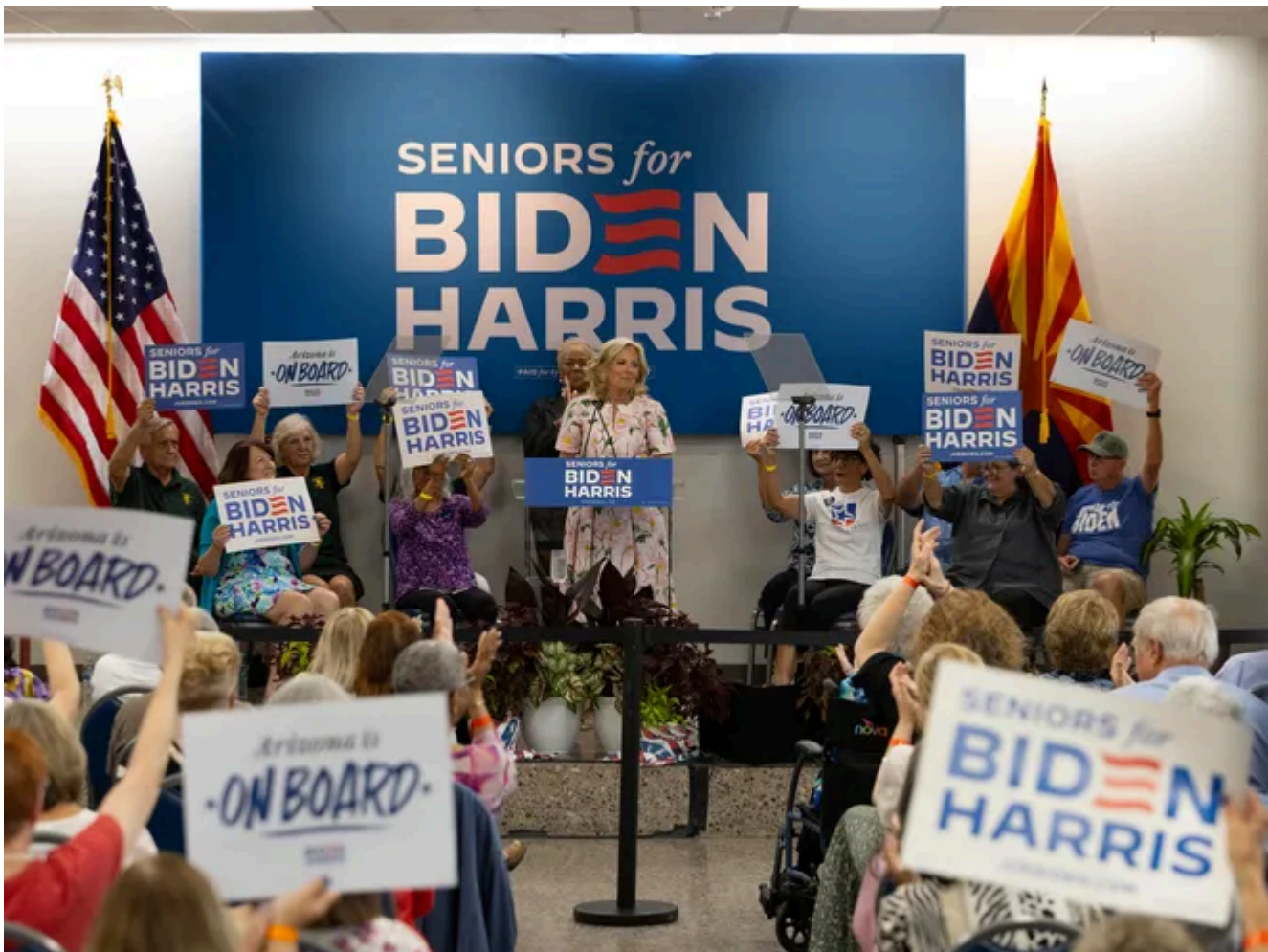
First Lady Dr. Jill Biden with seniors in Phoenix

Many Arizona Alliance members joined First Lady Dr. Jill Biden at Devonshire Senior Center on Saturday in Phoenix. The event was the last of several “Seniors for Biden” events Dr. Biden held last week.