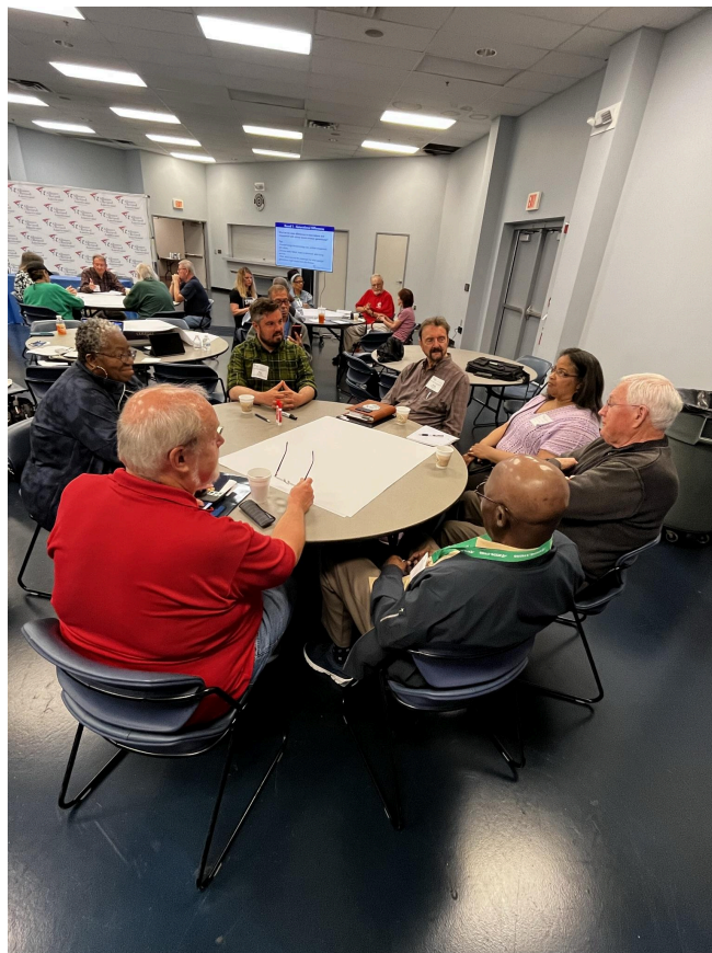
The meeting featured an intergenerational workshop.